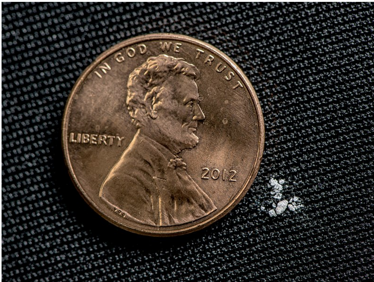
A lethal dose for most people